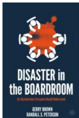
Disaster in the Boardroom Ladenpreis: 49,49EUR

Wir haben andere Produkte gefunden, die Ihnen gefallen könnten!