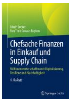
Chefsache Finanzen in Einkauf und Supply Chain Ladenpreis: 82,23EUR