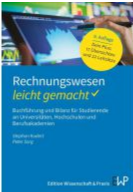
Rechnungswesen – leicht gemacht Ladenpreis: 17,40EUR