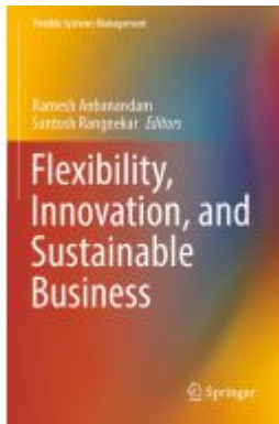
Flexibility, Innovation, and Sustainable Business Ladenpreis: 109,99EUR