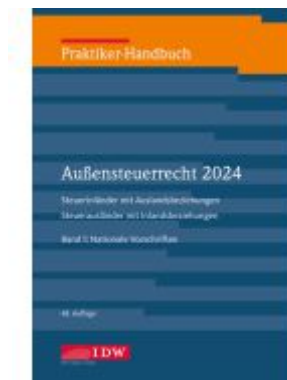
Praktiker-Handbuch Außensteuerrecht 2024, 2 Bde., 48.A. Ladenpreis: 112,10EUR