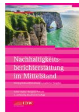
Nachhaltigkeitsberichterstattung im Mittelstand Ladenpreis: 50,40EUR