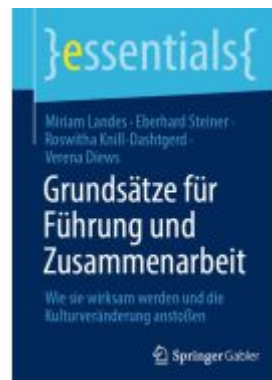
Grundsätze für Führung und Zusammenarbeit Ladenpreis: 15,41EUR