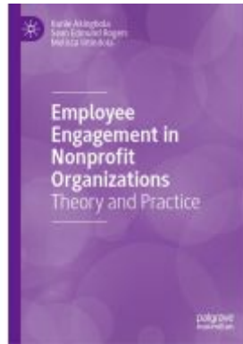
Employee Engagement in Nonprofit Organizations Ladenpreis: 175,99EUR