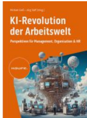
KI-Revolution der Arbeitswelt Ladenpreis: 51,40EUR