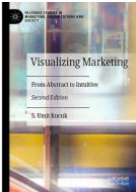
Visualizing Marketing Ladenpreis: 164,99EUR

Wir haben andere Produkte gefunden, die Ihnen gefallen könnten!