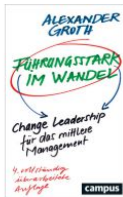
Führungsstark im Wandel Ladenpreis: 29,90EUR