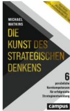
Die Kunst des strategischen Denkens Ladenpreis: 26,90EUR