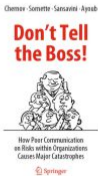
Don't Tell the Boss! Ladenpreis: 46,19EUR