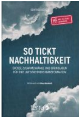
So tickt Nachhaltigkeit. Ladenpreis: 39,60EUR