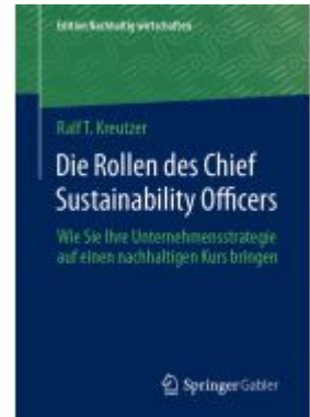
Die Rollen des Chief Sustainability Officers Ladenpreis: 25,69EUR