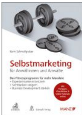
Selbstmarketing für Anwältinnen und Anwälte Das Fitnessprogramm für mehr Mandate

Wir haben andere Produkte gefunden, die Ihnen gefallen könnten!