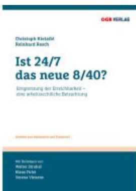
Ist 24/7 das neue 8/40?