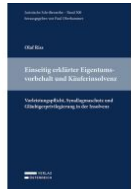
Einseitig erklärter Eigentumsvorbehalt und Käuferinsolvenz... Ladenpreis: 107,10EUR