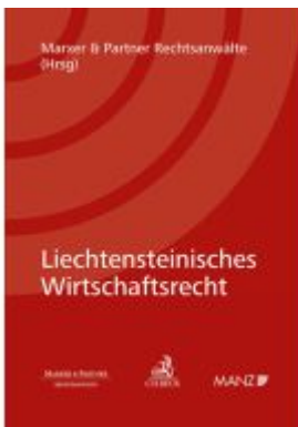
Liechtensteinisches Wirtschaftsrecht Ladenpreis: 142,00EUR