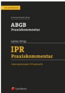
ABGB Praxiskommentar / IPR Praxiskommentar Ladenpreis: 360,00EUR