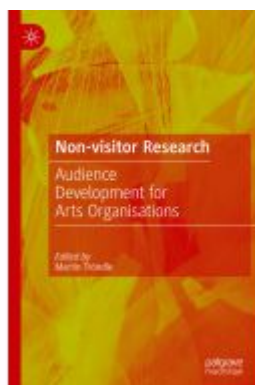
Non-Visitor Research Ladenpreis: 109,99EUR