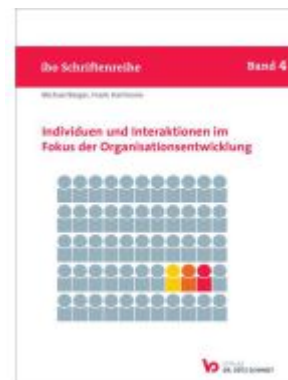
Individuen und Interaktionen im Fokus der Organisationsentwicklung Ladenpreis: 39,10EUR