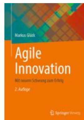
Agile Innovation Ladenpreis: 39,06EUR