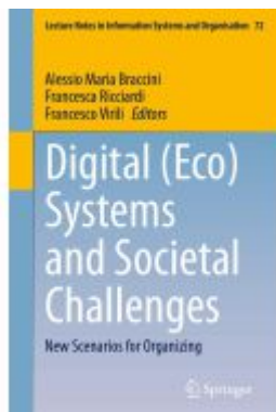
Digital (Eco) Systems and Societal Challenges Ladenpreis: 131,99EUR

Wir haben andere Produkte gefunden, die Ihnen gefallen könnten!