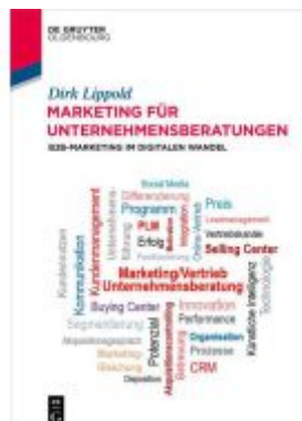
Marketing für Unternehmensberatungen Ladenpreis: 24,95EUR