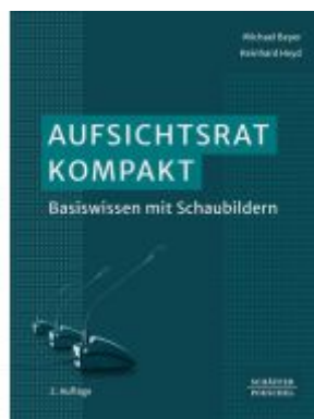
Aufsichtsrat kompakt Ladenpreis: 51,40EUR