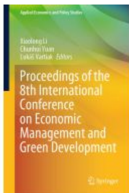
Proceedings of the 8th International Conference on Economic Management and Green Development