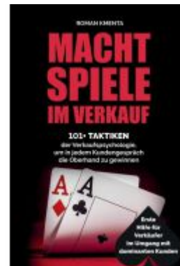
Machtspiele im Verkauf Ladenpreis: 19,97EUR