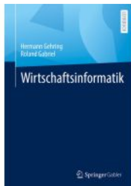
Wirtschaftsinformatik Ladenpreis: 56,53EUR