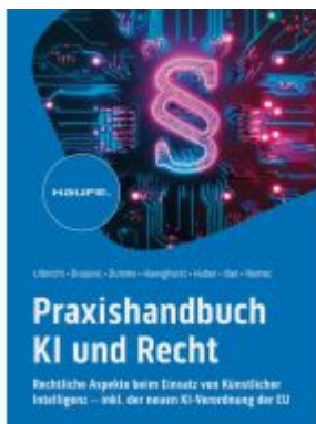
Praxishandbuch KI und Recht Ladenpreis: 72,00EUR