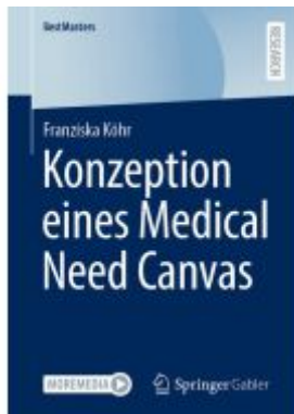
Konzeption eines Medical Need Canvas Ladenpreis: 66,81EUR