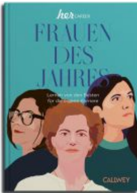
Frauen des Jahres 2023 Ladenpreis: 41,10EUR