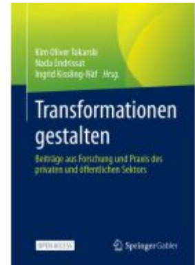
Transformationen gestalten Ladenpreis: 43,99EUR