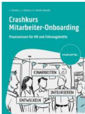
Crashkurs Mitarbeiter-Onboarding Ladenpreis: 30,80EUR

Wir haben andere Produkte gefunden, die Ihnen gefallen könnten!