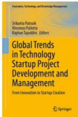
Global Trends in Technology Startup Project Development and Management Ladenpreis: 186,99EUR