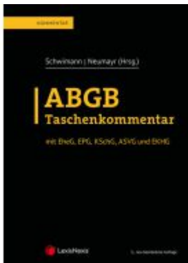
ABGB Taschenkommentar Ladenpreis: 319,00 EUR

Wir haben andere Produkte gefunden, die Ihnen gefallen könnten!