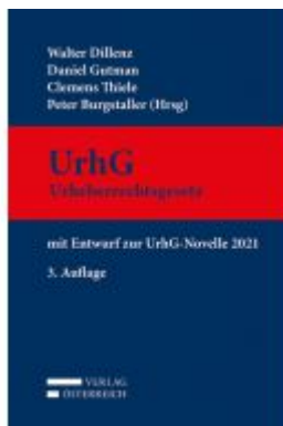
UrhG Urheberrechtsgesetz Ladenpreis: 349,00 EUR