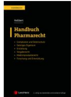
Handbuch Pharmarecht Ladenpreis: 89,00 EUR