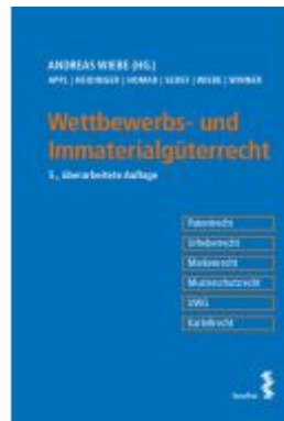
Wettbewerbs- und Immaterialgüterrecht Ladenpreis: 45,00 EUR