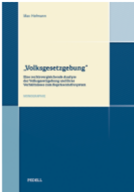
"Volksgesetzgebung" Ladenpreis: 40,00 EUR