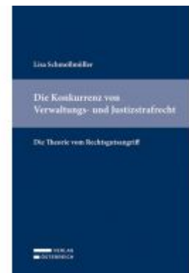
Die Konkurrenz von Verwaltungs- und Justizstrafrecht Ladenpreis: 79,00 EUR