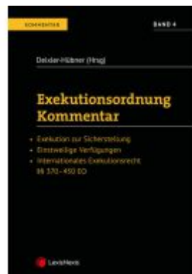
Exekutionsordnung - Kommentar Band 4 Ladenpreis: 128,80 EUR