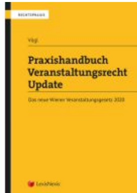
Praxishandbuch Veranstaltungsrecht Update Ladenpreis: 14,00 EUR