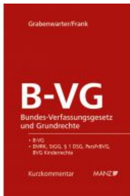
Bundes-Verfassungsgesetz und Grundrechte B-VG Ladenpreis: 98,00 EUR