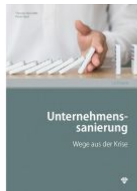
Unternehmenssanierung Ladenpreis: 31,90EUR