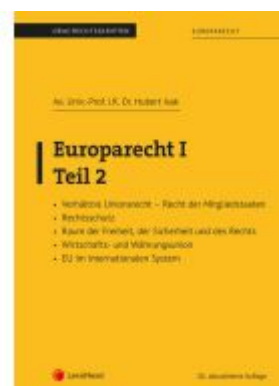
Europarecht I – Teil 2 Ladenpreis: 37,00EUR