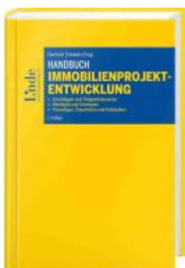
Handbuch Immobilienprojektentwicklung Ladenpreis: 108,00EUR