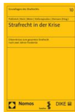
Strafrecht in der Krise Ladenpreis: 70,00EUR