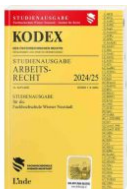
KODEX Studienausgabe Arbeitsrecht FH Wr. Neustadt 2024/25 Ladenpreis: 15,00EUR