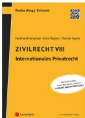
Zivilrecht VIII - Internationales Privatrecht Ladenpreis: 36,00EUR