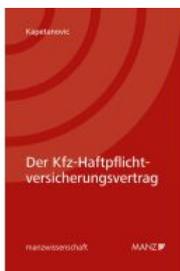
Der Kfz-Haftpflichtversicherungsvertrag Ladenpreis: 74,00EUR