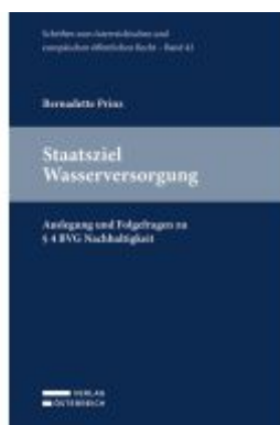
Staatsziel Wasserversorgung Ladenpreis: 69,00EUR