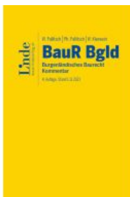
BauR Bgld. | Burgenländisches Baurecht Ladenpreis: 239,00EUR