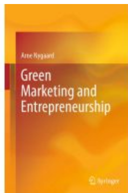
Green Marketing and Entrepreneurship Ladenpreis: 120,99EUR