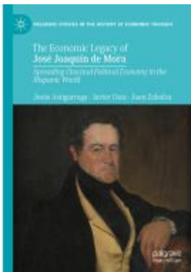
The Economic Legacy of José Joaquín de Mora