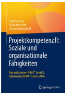
Projektkompetenz II: Soziale und organisationale Fähigkeiten Ladenpreis: 66,81EUR