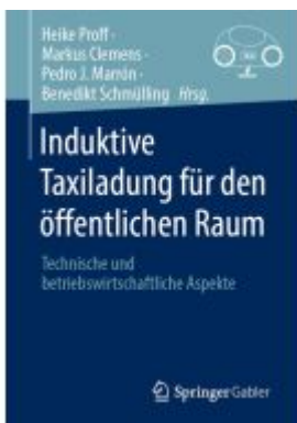
Induktive Taxiladung für den öffentlichen Raum Ladenpreis: 82,24EUR