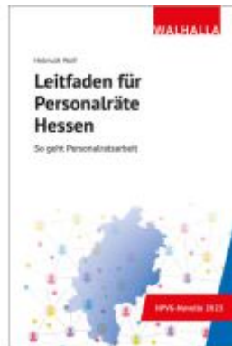
Leitfaden für Personalräte Hessen