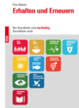
Erhalten und Erneuern Ladenpreis: 13,20EUR