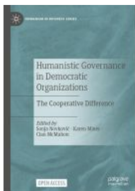
Humanistic Governance in Democratic Organizations Ladenpreis: 54,99EUR