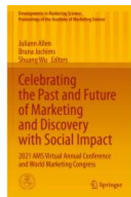
Celebrating the Past and Future of Marketing and Discovery with Social Impact Ladenpreis: 241,99EUR