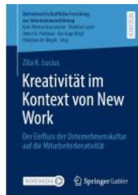
Kreativität im Kontext von New Work Ladenpreis: 71,95EUR