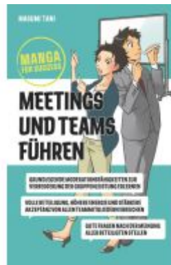
Manga for Success - Meetings und Teams führen Ladenpreis: 22,70EUR