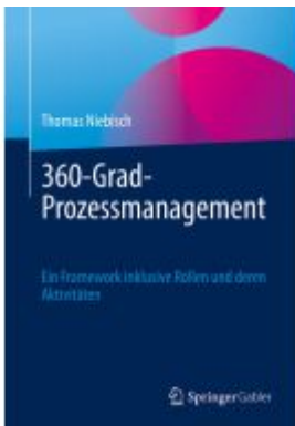
360-Grad-Prozessmanagement Ladenpreis: 56,53EUR