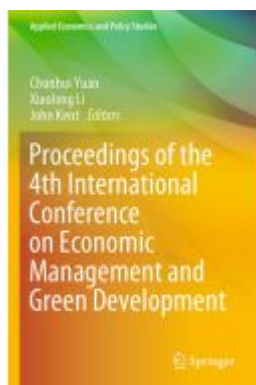
Proceedings of the 4th International Conference on Economic Management and Green Development Ladenpreis: 219,99EUR