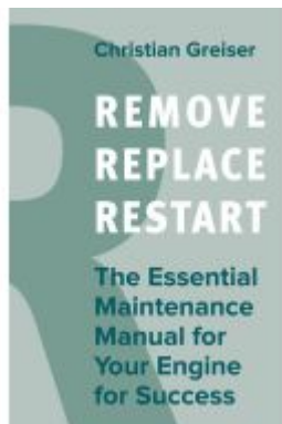
Remove, Replace, Restart Ladenpreis: 28,80EUR