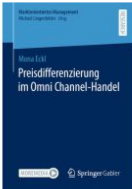
Preisdifferenzierung im Omni Channel- Handel Ladenpreis: 82,23EUR