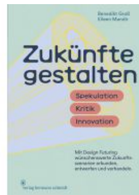
Zukünfte gestalten Ladenpreis: 41,20EUR