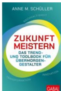
Zukunft meistern Ladenpreis: 30,80EUR