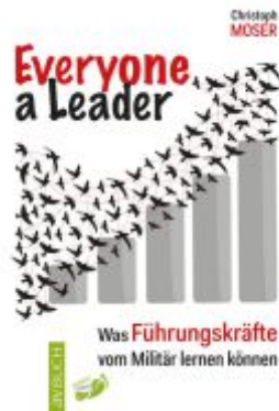
Everyone a leader Ladenpreis: 19,99EUR