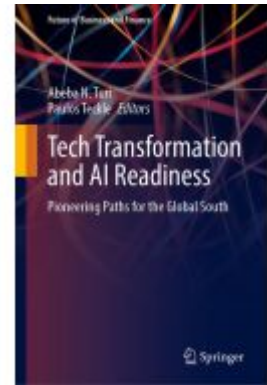
Tech Transformation and AI Readiness Ladenpreis: 109,99EUR