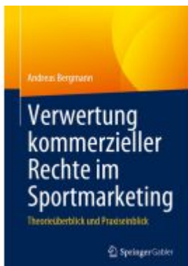
Verwertung kommerzieller Rechte im Sportmarketing Ladenpreis: 25,69EUR