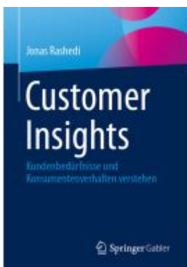
Customer Insights Ladenpreis: 35,97EUR