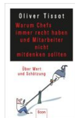
Warum Chefs immer recht haben und Mitarbeiter nicht mitdenken sollten Ladenpreis: 25,70EUR