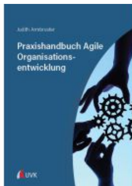
Praxishandbuch Agile Organisationsentwicklung Ladenpreis: 30,80EUR