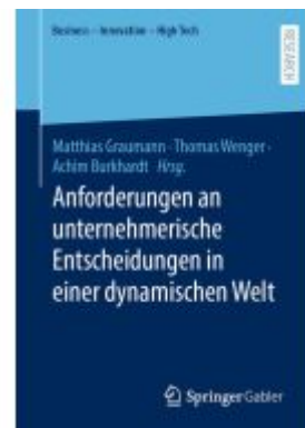
Anforderungen an unternehmerische Entscheidungen in einer dynamischen Welt Ladenpreis: 123,35EUR