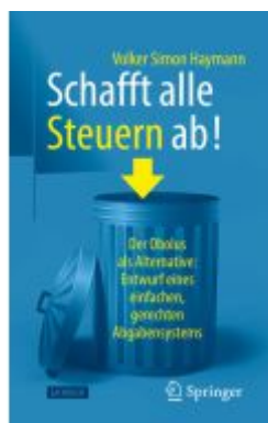
Schafft alle Steuern ab! Ladenpreis: 23,63EUR