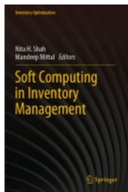
Soft Computing in Inventory Management Ladenpreis: 153,99EUR