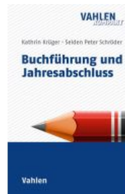
Buchführung und Jahresabschluss Ladenpreis: 23,60EUR