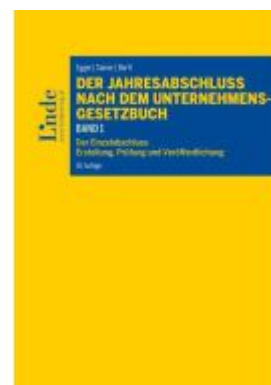
Der Jahresabschluss nach dem Unternehmensgesetzbuch, Band 1 Ladenpreis: 78,00EUR