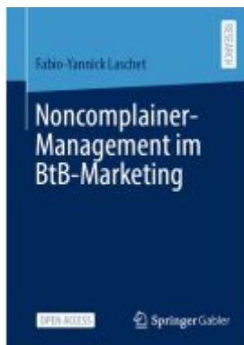
Noncomplainer-Management im BtB- Marketing Ladenpreis: 43,99EUR