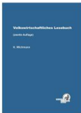
Volkswirtschaftliches Lesebuch – Zweite Auflage Ladenpreis: 25,70EUR