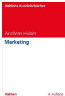
Marketing Ladenpreis: 25,60EUR