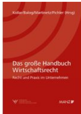
Das große Handbuch Wirtschaftsrecht Recht und Praxis im Unternehmen Ladenpreis: 238,00EUR