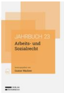
Arbeits- und Sozialrecht Ladenpreis: 74,00EUR