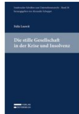
Die stille Gesellschaft in der Krise und Insolvenz Ladenpreis: 109,00EUR