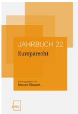
Europarecht Ladenpreis: 78,00EUR