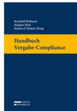
Handbuch Vergabe-Compliance Ladenpreis: 169,00EUR