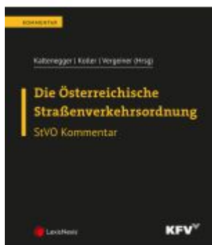
Die Österreichische Straßenverkehrsordnung Ladenpreis: 362,00EUR