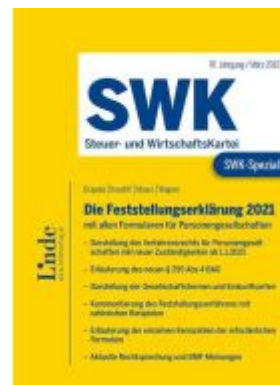
SWK-Spezial Die Feststellungserklärung 2021 Ladenpreis: 48,00EUR