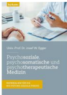
Psychosoziale, psychosomatische und psychotherapeutische Medizin Ladenpreis: 39,00EUR