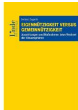
Eigennützigkeit versus Gemeinnützigkeit Ladenpreis: 39,00EUR