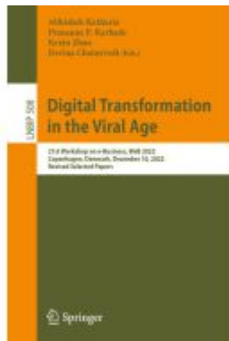
Digital Transformation in the Viral Age Ladenpreis: 98,99EUR

Wir haben andere Produkte gefunden, die Ihnen gefallen könnten!