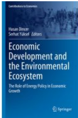
Economic Development and the Environmental Ecosystem Ladenpreis: 175,99EUR