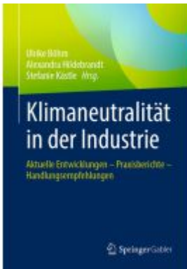
Klimaneutralität in der Industrie Ladenpreis: 56,53EUR