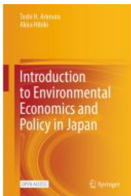
Introduction to Environmental Economics and Policy in Japan Ladenpreis: 54,99EUR