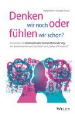
Denken wir noch oder fühlen wir schon? Ladenpreis: 25,70EUR