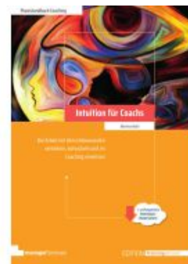
Intuition für Coaches Ladenpreis: 51,30EUR