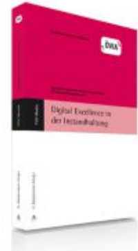
Digital Excellence in der Instandhaltung Ladenpreis: 72,00EUR