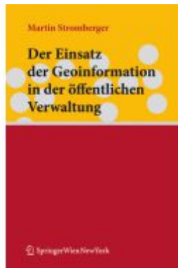
Der Einsatz der Geoinformation in der öffentlichen Verwaltung Ladenpreis: 29,95EUR