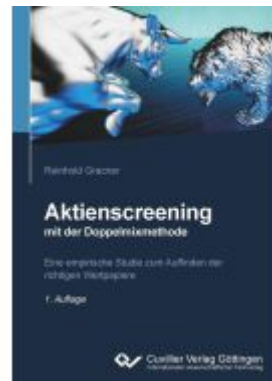
Aktienscreening mit der Doppelmixmethode Ladenpreis: 44,10EUR