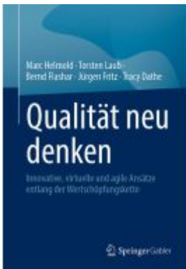
Qualität neu denken Ladenpreis: 56,53EUR