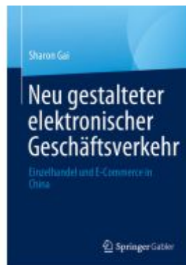
Neu gestalteter elektronischer Geschäftsverkehr Ladenpreis: 56,53EUR