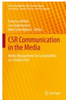
CSR Communication in the Media Ladenpreis: 164,99EUR