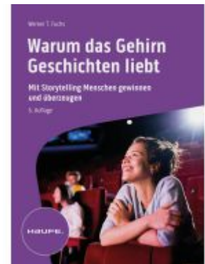
Warum das Gehirn Geschichten liebt Ladenpreis: 51,40EUR