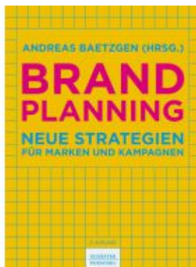
Brand Planning Ladenpreis: 61,70EUR