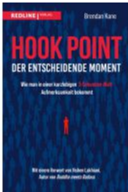
Hook Point – der entscheidende Moment Ladenpreis: 20,60EUR