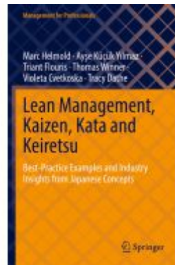
Lean Management, Kaizen, Kata and Keiretsu Ladenpreis: 54,99EUR