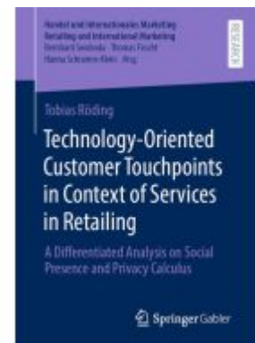
Technology-Oriented Customer Touchpoints in Context of Services in Retailing Ladenpreis: 93,49EUR