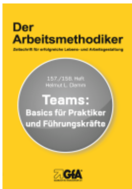
Teams: Ladenpreis: 20,40EUR