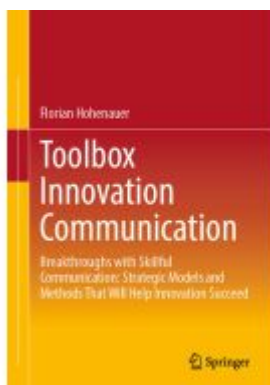
Toolbox Innovation Communication Ladenpreis: 82,49EUR