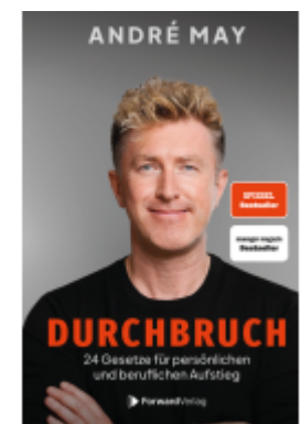
Durchbruch Ladenpreis: 20,00EUR