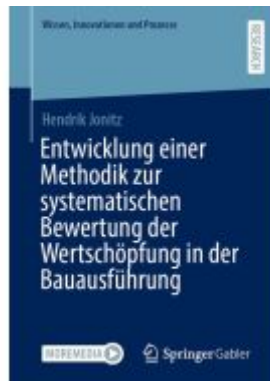
Entwicklung einer Methodik zur systematischen Bewertung der Wertschöpfung in der Bauausführung Ladenpreis: 87,37EUR