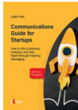
Communications Guide for Startups Ladenpreis: 30,80EUR