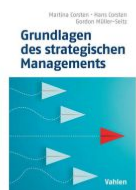
Grundlagen des strategischen Managements Ladenpreis: 30,70EUR