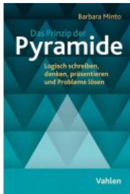
Das Prinzip der Pyramide Ladenpreis: 46,20EUR