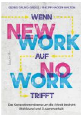
Wenn new work auf no work trifft Ladenpreis: 19,00EUR

Wir haben andere Produkte gefunden, die Ihnen gefallen könnten!