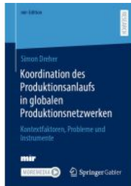
Koordination des Produktionsanlaufs in globalen Produktionsnetzwerken Ladenpreis: 77,09EUR