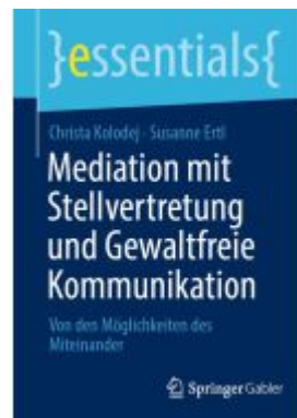
Mediation mit Stellvertretung und Gewaltfreie Kommunikation Ladenpreis: 15,41EUR