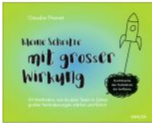
Kleine Schritte mit großer Wirkung Ladenpreis: 35,90EUR