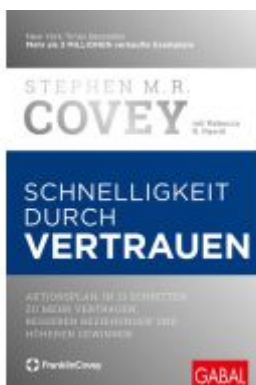
Schnelligkeit durch Vertrauen Ladenpreis: 32,90EUR