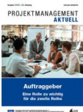
PROJEKTMANAGEMENT AKTUELL 4 (2022) Ladenpreis: 20,60EUR

Wir haben andere Produkte gefunden, die Ihnen gefallen könnten!