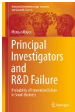
Principal Investigators and R&D Failure Ladenpreis: 153,99EUR