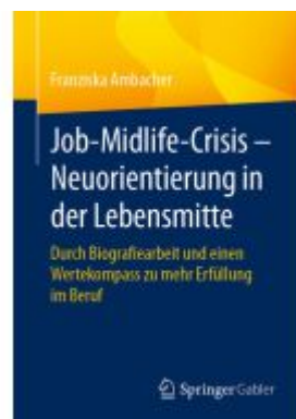
Job-Midlife-Crisis – Neuorientierung in der Lebensmitte Ladenpreis: 46,25EUR