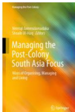
Managing the Post-Colony South Asia Focus Ladenpreis: 186,99EUR