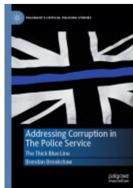
Addressing Corruption in The Police Service Ladenpreis: 131,99EUR