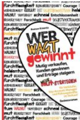
Wer wagt, gewinnt Ladenpreis: 19,97EUR