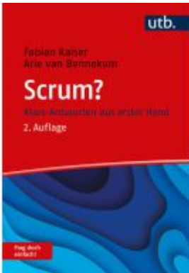
Scrum? Frag doch einfach! Ladenpreis: 20,50EUR