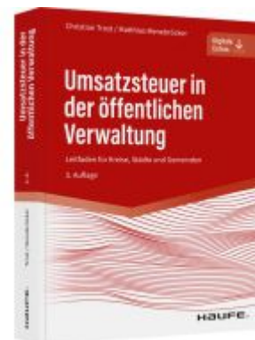
Umsatzsteuer in der öffentlichen Verwaltung Ladenpreis: 82,20EUR