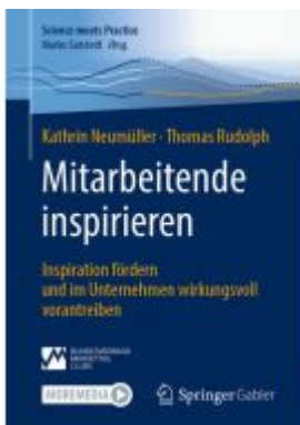
Mitarbeitende inspirieren Ladenpreis: 30,83EUR