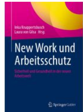
New Work und Arbeitsschutz Ladenpreis: 51,39EUR