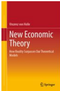
New Economic Theory Ladenpreis: 65,99EUR