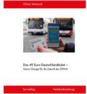
Das 49 Euro Deutschlandticket - Game Changer für die Zukunft des ÖPNV? Ladenpreis: 35,00EUR