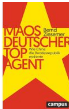
Maos deutscher Topagent Ladenpreis: 28,80EUR