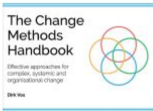
The Change Methods Handbook Ladenpreis: 36,99EUR