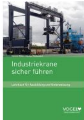
Industriekrane sicher führen Ladenpreis: 19,30EUR