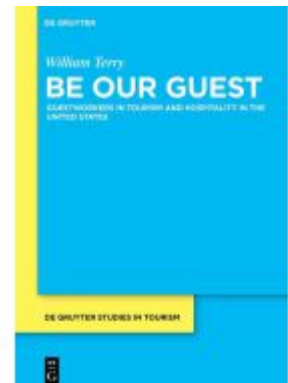
Be Our Guest Ladenpreis: 104,95EUR