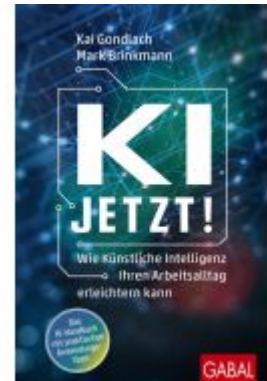
KI jetzt! Ladenpreis: 30,80EUR