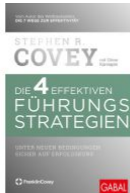
Die 4 effektiven Führungsstrategien Ladenpreis: 30,80EUR