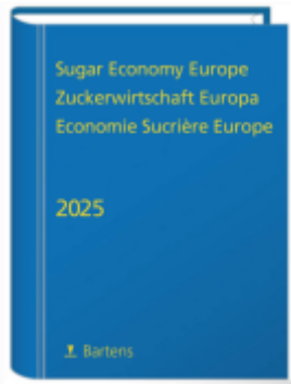
Sugar Economy Europe Zuckerwirtschaft Europa Europa Economie Sucrière Europe 2025 Ladenpreis: 60,50EUR