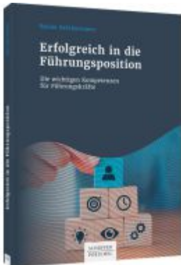
Erfolgreich in die Führungsposition Ladenpreis: 30,80EUR