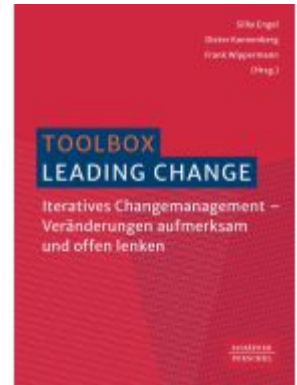
Toolbox Leading Change Ladenpreis: 41,20EUR