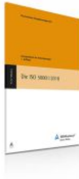
Die Iso 50001:2018 Ladenpreis: 52,80EUR