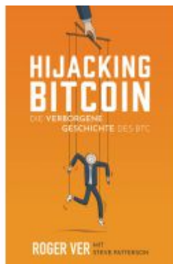
Hijacking Bitcoin Ladenpreis: 39,99EUR