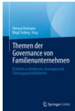
Themen der Governance von Familienunternehmen Ladenpreis: 51,39EUR