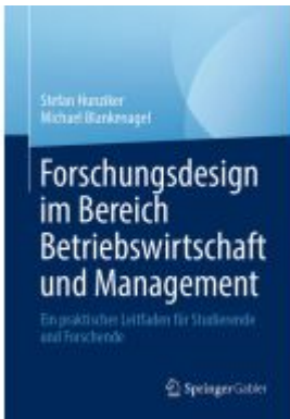
Forschungsdesign im Bereich Betriebswirtschaft und Management Ladenpreis: 56,53EUR