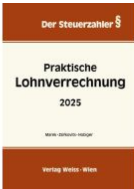
Praktische Lohnverrechnung 2025 Ladenpreis: 72,60EUR

Wir haben andere Produkte gefunden, die Ihnen gefallen könnten!