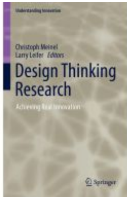
Design Thinking Research Ladenpreis: 109,99EUR