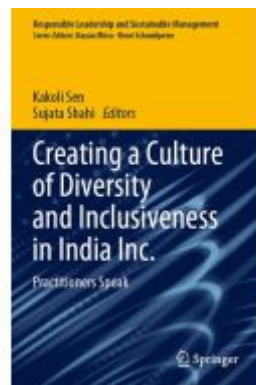
Creating a Culture of Diversity and Inclusiveness in India Inc. Ladenpreis: 164,99EUR