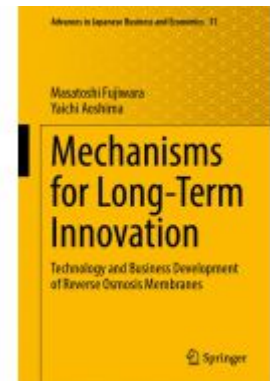
Mechanisms for Long-Term Innovation Ladenpreis: 175,99EUR