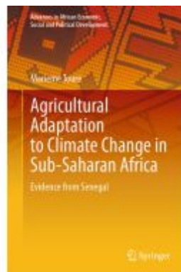
Agricultural Adaptation to Climate Change in Sub-Saharan Africa Ladenpreis: 109,99EUR