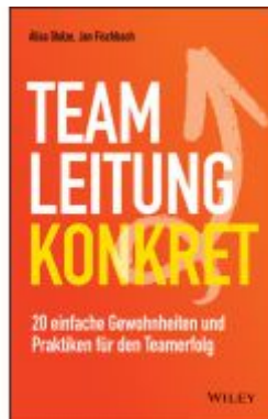
Teamleitung konkret Ladenpreis: 25,70EUR