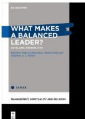
What Makes a Balanced Leader? Ladenpreis: 104,95EUR