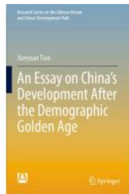
An Essay on China's Development After the Demographic Golden Age Ladenpreis: 131,99EUR