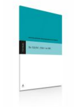
Die ISO/IEC 27001 im IMS Ladenpreis: 52,80EUR