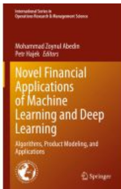
Novel Financial Applications of Machine Learning and Deep Learning Ladenpreis: 186,99EUR