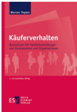
Käuferverhalten Ladenpreis: 41,10EUR