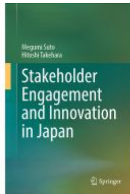
Stakeholder Engagement and Innovation in Japan Ladenpreis: 142,99EUR