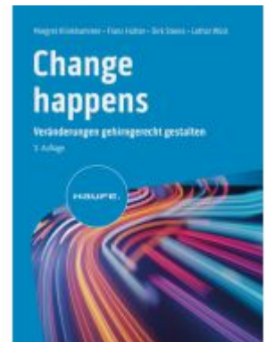
Change happens Ladenpreis: 56,60EUR