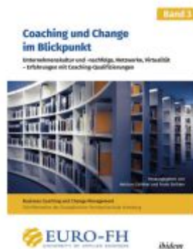
Coaching und Change im Blickpunkt. Band III Ladenpreis: 32,80EUR