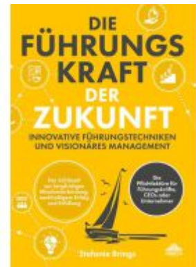
Die Führungskraft der Zukunft – Innovative Führungstechniken und visionäres Management Ladenpreis: 20,60EUR