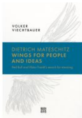
Dietrich Mateschitz: Wings for People and Ideas Ladenpreis: 26,80EUR