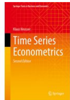
Time Series Econometrics Ladenpreis: 109,99EUR