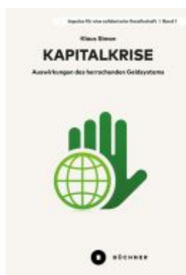
Kapitalkrise Ladenpreis: 15,00EUR