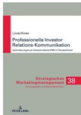
Professionelle Investor Relations- Kommunikation Ladenpreis: 63,70EUR