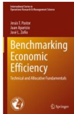
Benchmarking Economic Efficiency Ladenpreis: 153,99EUR