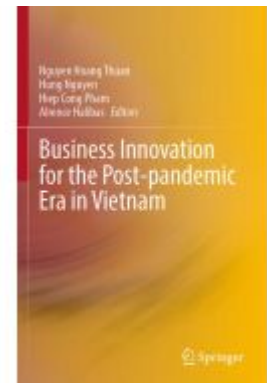
Business Innovation for the Post-pandemic Era in Vietnam Ladenpreis: 164,99EUR