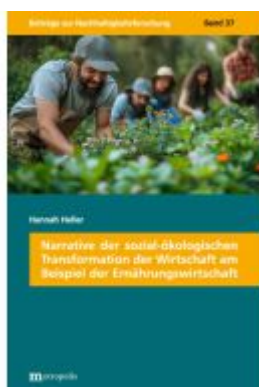
Narrative der sozial-ökologischen Transformation der Wirtschaft am Beispiel der Ernährungswirtschaft Ladenpreis: 70,00EUR