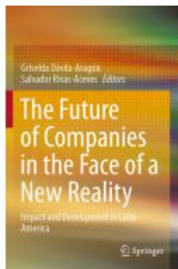
The Future of Companies in the Face of a New Reality Ladenpreis: 175,99EUR