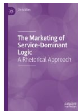
The Marketing of Service-Dominant Logic Ladenpreis: 153,99EUR