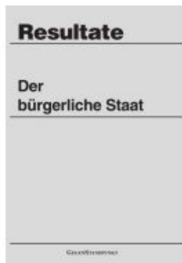
Der bürgerliche Staat Ladenpreis: 15,00EUR