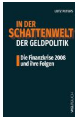
In der Schattenwelt der Geldpolitik Ladenpreis: 15,40EUR