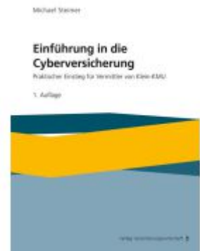
Einführung in die Cyberversicherung Ladenpreis: 35,80EUR