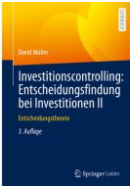
Investitionscontrolling: Entscheidungsfindung bei Investitionen II Ladenpreis: 35,97EUR

Wir haben andere Produkte gefunden, die Ihnen gefallen könnten!