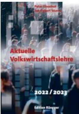
Aktuelle Volkswirtschaftslehre 2022/2023 Ladenpreis: 60,00EUR