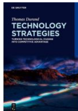
Technology Strategies Ladenpreis: 39,95EUR