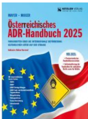
Österreichisches ADR-Handbuch 2025 - Loseblatt Ladenpreis: 154,00EUR