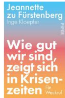
Wie gut wir sind, zeigt sich in Krisenzeiten Ladenpreis: 22,70EUR