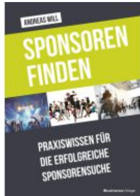
Sponsoren finden Ladenpreis: 30,80EUR