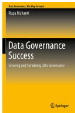
Data Governance Success Ladenpreis: 62,69EUR