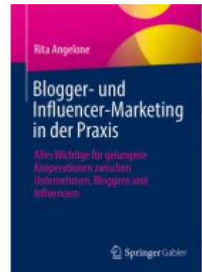
Blogger- und Influencer-Marketing in der Praxis