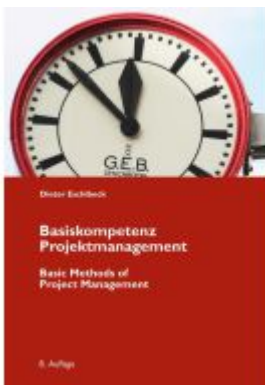
Basiskompetenz Projektmanagement Ladenpreis: 25,60EUR