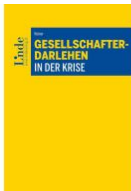
Gesellschafterdarlehen in der Krise Ladenpreis: 34,00EUR