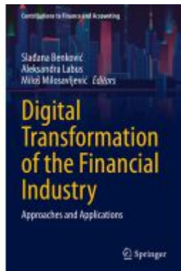
Digital Transformation of the Financial Industry

Wir haben andere Produkte gefunden, die Ihnen gefallen könnten!