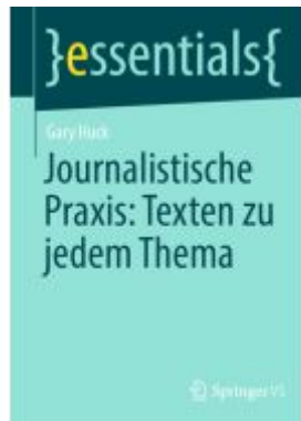
Journalistische Praxis: Texten zu jedem Thema