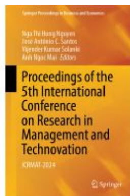
Proceedings of the 5th International Conference on Research in Management and Technovation