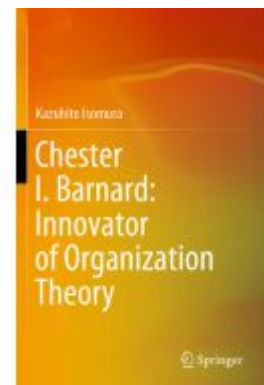
Chester I. Barnard: Innovator of Organization Theory Ladenpreis: 131,99EUR