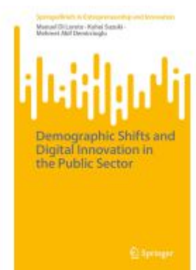
Demographic Shifts and Digital Innovation in the Public Sector Ladenpreis: 54,99EUR