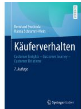
Käuferverhalten Ladenpreis: 46,25EUR