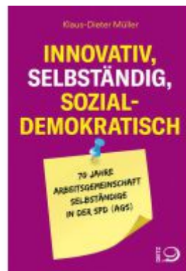
Innovativ, selbständig, sozialdemokratisch Ladenpreis: 18,50EUR