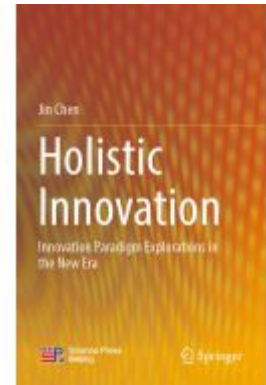
Holistic Innovation Ladenpreis: 175,99EUR