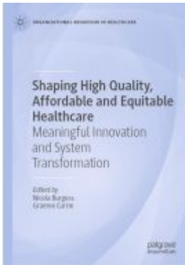
Shaping High Quality, Affordable and Equitable Healthcare Ladenpreis: 186,99EUR