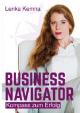
BUSINESS NAVIGATOR Ladenpreis: 21,60EUR