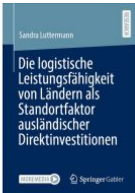
Die logistische Leistungsfähigkeit von Ländern als Standortfaktor ausländischer Direktinvestitionen Ladenpreis: 77,09EUR

Wir haben andere Produkte gefunden, die Ihnen gefallen könnten!