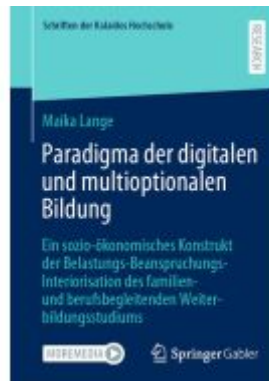
Paradigma der digitalen und multioptionalen Bildung Ladenpreis: 82,23EUR