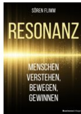
Resonanz Ladenpreis: 25,70EUR