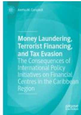
Money Laundering, Terrorist Financing, and Tax Evasion Ladenpreis: 131,99EUR