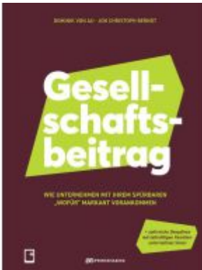
Gesellschaftsbeitrag Ladenpreis: 25,70EUR