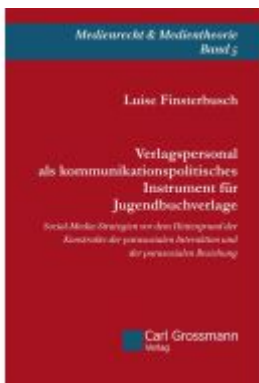
Verlagspersonal als kommunikationspolitisches Instrument für Jugendbuchverlage Ladenpreis: 66,90EUR