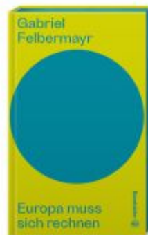
Europa muss sich rechnen Ladenpreis: 20,00EUR