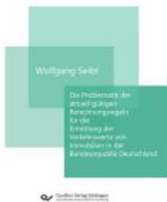
Die Problematik der aktuell gültigen Berechnungsregeln für die Ermittlung der Verkehrswerte von Immobilien in der Bundesrepublik Deutschland Ladenpreis: 55,00EUR