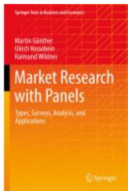
Market Research with Panels Ladenpreis: 54,99EUR