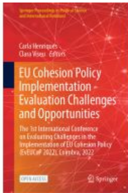
EU Cohesion Policy Implementation - Evaluation Challenges and Opportunities Ladenpreis: 54,99EUR