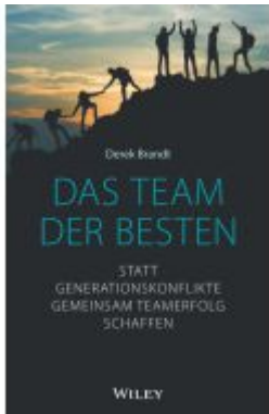
Das Team der Besten Ladenpreis: 25,70EUR

Wir haben andere Produkte gefunden, die Ihnen gefallen könnten!