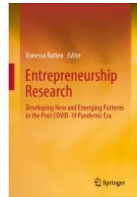
Entrepreneurship Research Ladenpreis: 164,99EUR