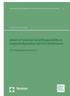
Impact of Corporate Social Responsibility on Corporate Reputation and Firm Performance Ladenpreis: 60,70EUR