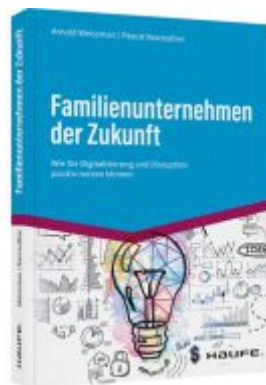
Familienunternehmen der Zukunft Ladenpreis: 51,40EUR