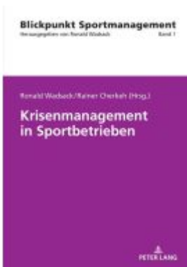
Krisenmanagement in Sportbetrieben Ladenpreis: 46,20EUR