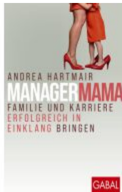
ManagerMama Ladenpreis: 28,80EUR