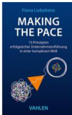
Making the Pace Ladenpreis: 27,70EUR