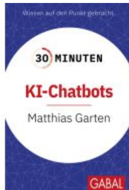
30 Minuten KI-Chatbots Ladenpreis: 11,30EUR