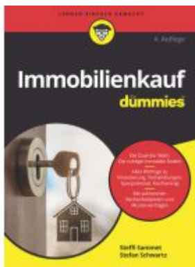
Immobilienkauf für Dummies Ladenpreis: 20,60EUR