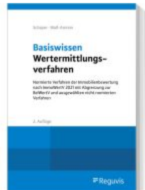
Basiswissen Wertermittlungsverfahren Ladenpreis: 49,40EUR