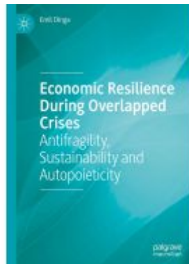
Economic Resilience During Overlapped Crises Ladenpreis: 131,99EUR