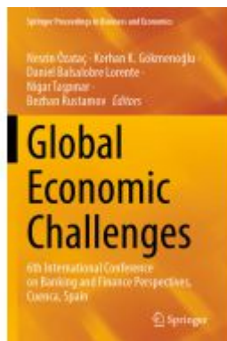
Global Economic Challenges Ladenpreis: 186,99EUR