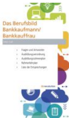
Das Berufsbild Bankkaufmann/Bankkauffrau Ladenpreis: 19,80EUR