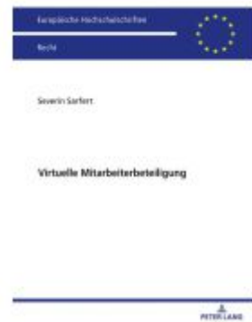
Virtuelle Mitarbeiterbeteiligung Ladenpreis: 46,20EUR