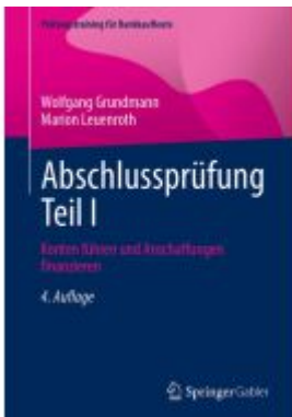
Abschlussprüfung Teil I Ladenpreis: 51,39EUR

Wir haben andere Produkte gefunden, die Ihnen gefallen könnten!