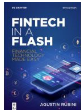
Fintech in a Flash Ladenpreis: 24,95EUR