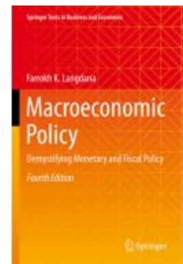
Macroeconomic Policy Ladenpreis: 71,49EUR