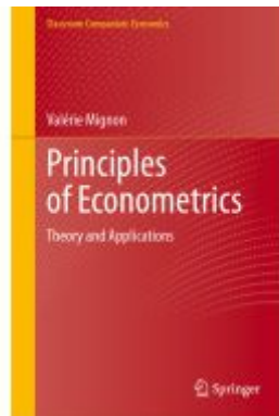
Principles of Econometrics Ladenpreis: 98,99EUR