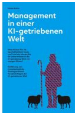
Management in einer KI-getriebenen Welt Ladenpreis: 12,99EUR

Wir haben andere Produkte gefunden, die Ihnen gefallen könnten!