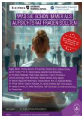
Was Sie als Aufsichtsrat schon immer fragen sollten