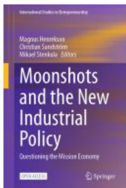
Moonshots and the New Industrial Policy