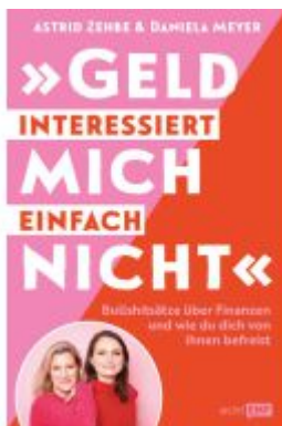
„Geld interessiert mich einfach nicht“ Ladenpreis: 14,40EUR