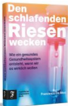
Den schlafenden Riesen wecken