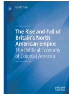
The Rise and Fall of Britain's North American Empire Ladenpreis: 109,99EUR