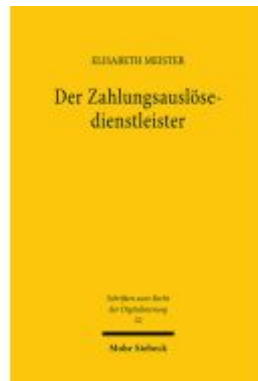
Der Zahlungsauslösedienstleister Ladenpreis: 101,80EUR