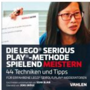
Die Lego® Serious Play®-Methode spielend meistern Ladenpreis: 41,00EUR