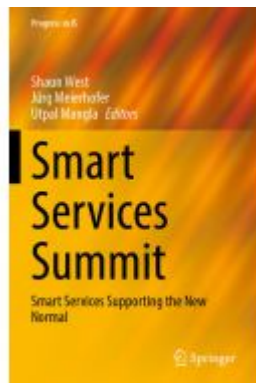
Smart Services Summit Ladenpreis: 164,99EUR