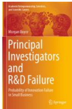
Principal Investigators and R&D Failure Ladenpreis: 153,99EUR

Wir haben andere Produkte gefunden, die Ihnen gefallen könnten!