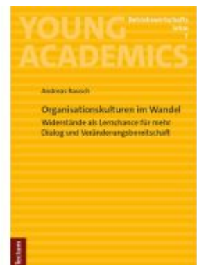
Organisationskulturen im Wandel Ladenpreis: 35,00EUR