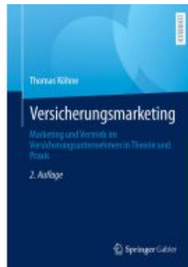
Versicherungsmarketing Ladenpreis: 51,39EUR