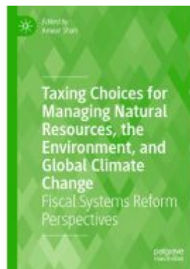
Taxing Choices for Managing Natural Resources, the Environment, and Global Climate Change Ladenpreis: 186,99EUR