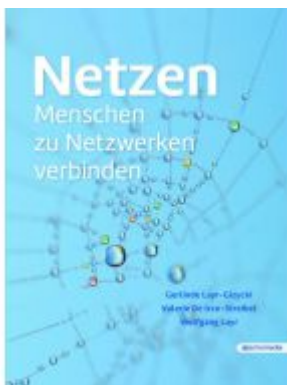
Netzen Ladenpreis: 29,90EUR