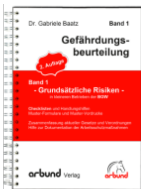
Band 1 - Gefährdungsbeurteilung "Grundsätzliche Risiken" Ladenpreis: 153,20EUR