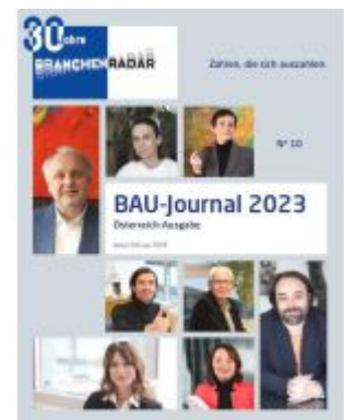
BRANCHENRADAR Bau-Journal 2023 Ladenpreis: 49,00EUR