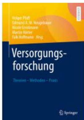
Versorgungsforschung Ladenpreis: 61,67EUR