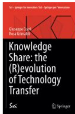
Knowledge Share: the (R)evolution of Technology Transfer Ladenpreis: 93,49EUR