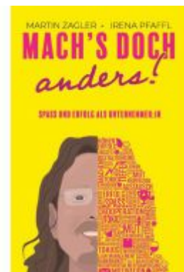
Mach's doch anders Ladenpreis: 22,00EUR