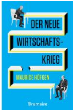
Der neue Wirtschaftskrieg Ladenpreis: 15,50EUR

Wir haben andere Produkte gefunden, die Ihnen gefallen könnten!