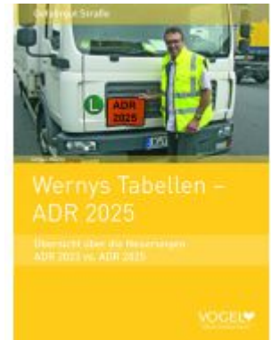
Wernys Tabellen – ADR 2025 Ladenpreis: 27,80EUR