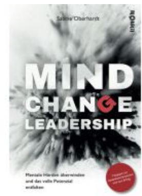
MIND CHANGE LEADERSHIP® Ladenpreis: 18,70EUR