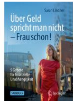
Über Geld spricht man nicht – Frau schon! Ladenpreis: 23,64EUR