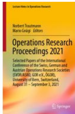
Operations Research Proceedings 2021 Ladenpreis: 164,99EUR