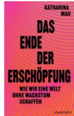
Das Ende der Erschöpfung Ladenpreis: 22,90EUR