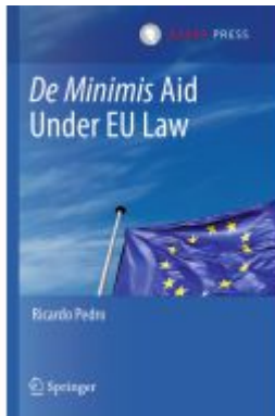
De Minimis Aid Under EU Law Ladenpreis: 109,99EUR