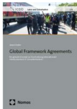
Global Framework Agreements Ladenpreis: 50,40EUR