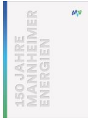
150 Jahre Mannheimer Energien Ladenpreis: 39,10EUR