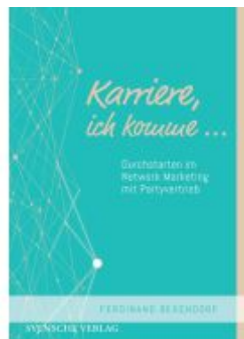
Karriere, ich komme... Ladenpreis: 15,50EUR