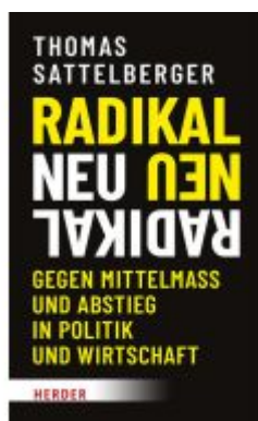
Radikal neu Ladenpreis: 25,80EUR