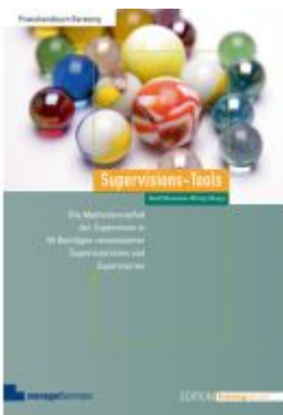
Supervisions-Tools Ladenpreis: 51,30EUR