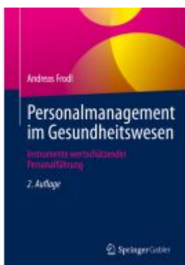
Personalmanagement im Gesundheitswesen Ladenpreis: 61,68EUR