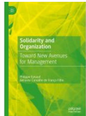
Solidarity and Organization Ladenpreis: 164,99EUR