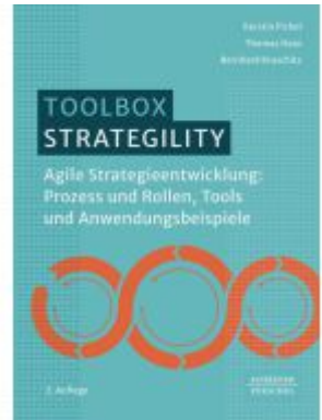
Strategility Ladenpreis: 41,20EUR