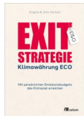
Exit-Strategie Klimawährung ECO Ladenpreis: 24,70EUR