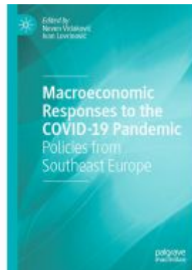
Macroeconomic Responses to the COVID-19 Pandemic Ladenpreis: 197,99EUR