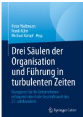
Drei Säulen der Organisation und Führung in turbulenten Zeiten Ladenpreis: 66,81EUR