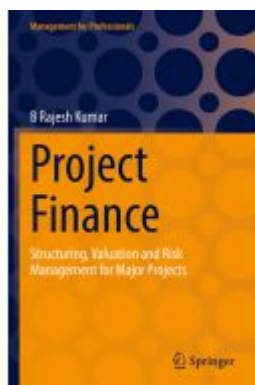
Project Finance Ladenpreis: 71,49EUR