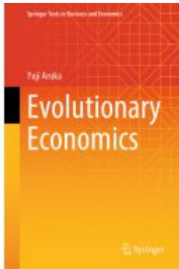
Evolutionary Economics Ladenpreis: 109,99EUR