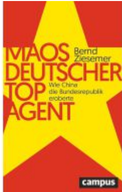
Maos deutscher Topagent Ladenpreis: 28,80EUR