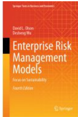
Enterprise Risk Management Models Ladenpreis: 120,99EUR