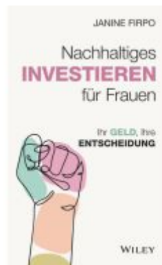
Nachhaltiges Investieren für Frauen Ladenpreis: 30,90EUR