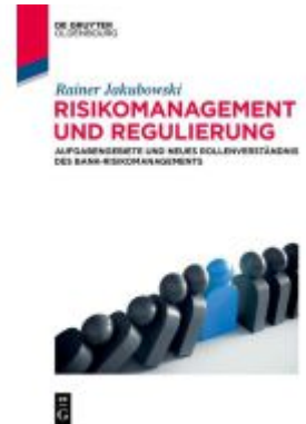
Risikomanagement und Regulierung Ladenpreis: 44,95EUR