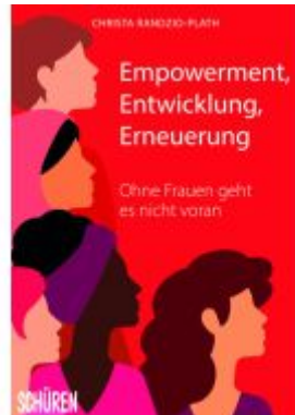
Empowerment, Entwicklung, Erneuerung Ladenpreis: 15,50EUR