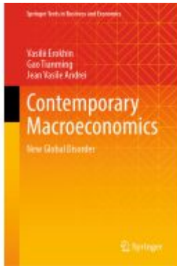
Contemporary Macroeconomics Ladenpreis: 153,99EUR