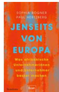
Jenseits von Europa Ladenpreis: 25,70EUR