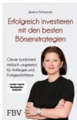
Erfolgreich investieren mit den besten Börsenstrategien Ladenpreis: 18,60EUR