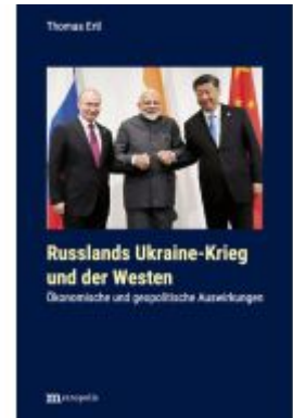
Russlands Ukraine-Krieg und der Westen Ladenpreis: 20,40EUR