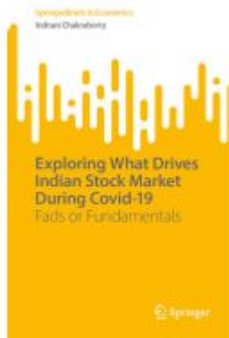
Exploring What Drives Indian Stock Market During Covid-19 Ladenpreis: 49,49EUR