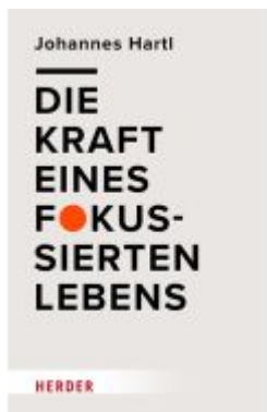
Die Kraft eines fokussierten Lebens Ladenpreis: 16,50EUR

Wir haben andere Produkte gefunden, die Ihnen gefallen könnten!