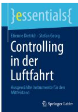
Controlling in der Luftfahrt Ladenpreis: 15,41EUR