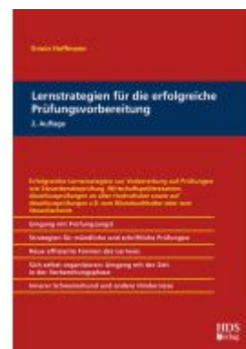
Lernstrategien für die erfolgreiche Prüfungsvorbereitung Ladenpreis: 56,50EUR