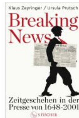
Breaking News Ladenpreis: 29,90EUR