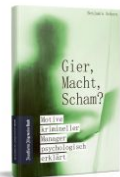
Gier, Macht, Scham? Ladenpreis: 22,60EUR