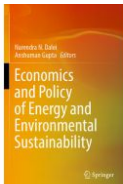
Economics and Policy of Energy and Environmental Sustainability Ladenpreis: 164,99EUR