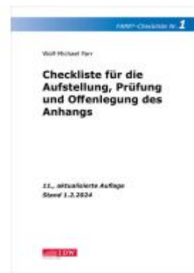
FARR Checkliste 1 für die Aufstellung, Prüfung und Offenlegung des Anhangs Ladenpreis: 44,30EUR