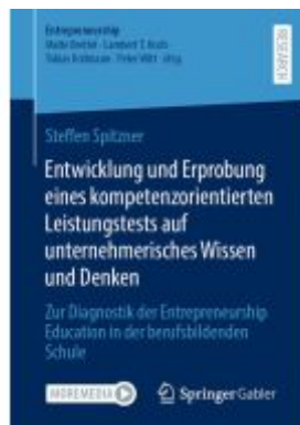
Entwicklung und Erprobung eines kompetenzorientierten Leistungstests auf unternehmerisches Wissen und Denken Ladenpreis: 77,09EUR