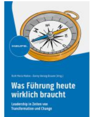
Was Führung heute wirklich braucht Ladenpreis: 51,40EUR