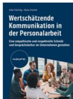
Wertschätzende Kommunikation in der Personalarbeit