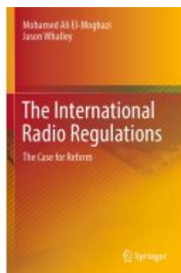
The International Radio Regulations