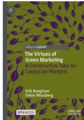
The Virtues of Green Marketing Ladenpreis: 43,99EUR