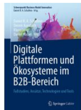
Digitale Plattformen und Ökosysteme im B2B-Bereich