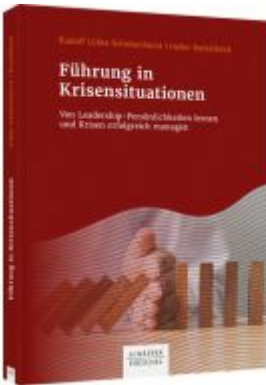
Führung in Krisensituationen Ladenpreis: 41,10EUR