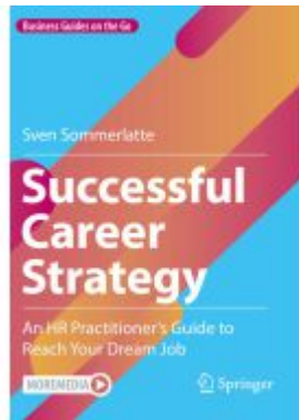
Successful Career Strategy Ladenpreis: 41,79EUR