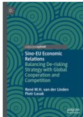
Sino-EU Economic Relations