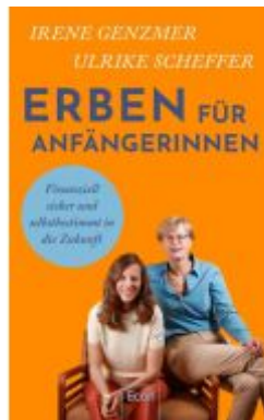
Erben für Anfängerinnen Ladenpreis: 25,70EUR