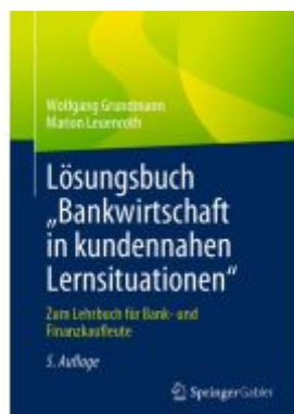
Lösungsbuch „Bankwirtschaft in kundennahen Lernsituationen“ Ladenpreis: 28,77EUR