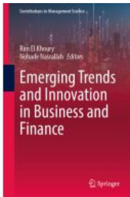
Emerging Trends and Innovation in Business and Finance Ladenpreis: 219,99EUR