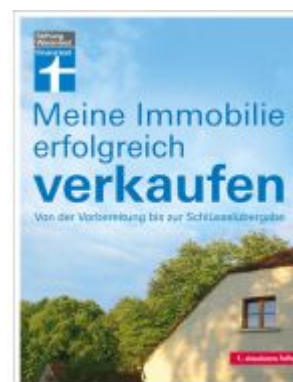
Meine Immobilie erfolgreich verkaufen Ladenpreis: 23,60EUR