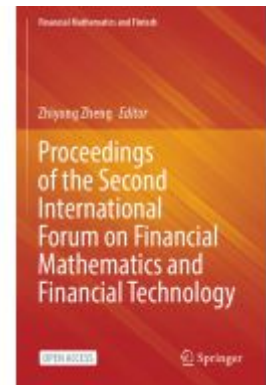
Proceedings of the Second International Forum on Financial Mathematics and Financial Technology Ladenpreis: 43,99EUR