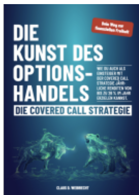
Die Kunst des Optionshandels – Die Covered Call Strategie Ladenpreis: 27,90EUR