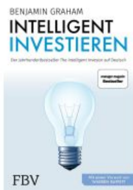
Intelligent investieren Ladenpreis: 41,20EUR