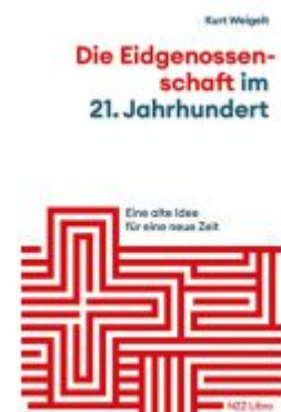
Die Eidgenossenschaft im 21. Jahrhundert Ladenpreis: 28,80EUR