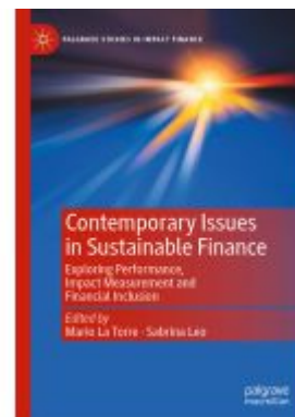
Contemporary Issues in Sustainable Finance Ladenpreis: 175,99EUR