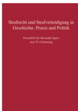
Strafrecht und Strafverteidigung in Geschichte, Praxis und Politik Ladenpreis: 329,00EUR