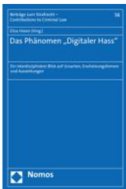
Das Phänomen „Digitaler Hass“ Ladenpreis: 60,70EUR