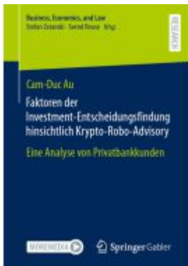
Faktoren der Investment- Entscheidungsfindung hinsichtlich Krypto- Robo-Advisory Ladenpreis: 71,95EUR

Wir haben andere Produkte gefunden, die Ihnen gefallen könnten!