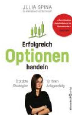
Erfolgreich Optionen handeln Ladenpreis: 30,70EUR