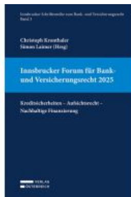
Innsbrucker Forum für Bank- und Versicherungsrecht 2025 Ladenpreis: 59,00EUR