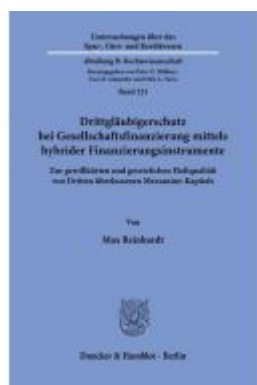
Drittgläubigerschutz bei Gesellschaftsfinanzierung mittels hybrider Finanzierungsinstrumente. Ladenpreis: 71,90EUR