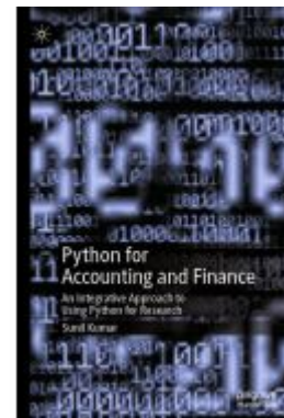
Python for Accounting and Finance Ladenpreis: 87,99EUR