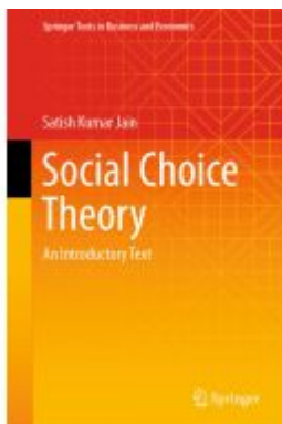
Social Choice Theory Ladenpreis: 98,99EUR