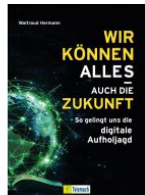
Wir können alles – auch die Zukunft! Ladenpreis: 20,60EUR