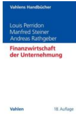
Finanzwirtschaft der Unternehmung Ladenpreis: 41,00EUR