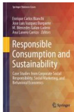
Responsible Consumption and Sustainability Ladenpreis: 82,49EUR