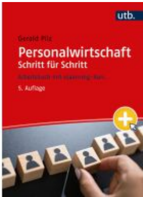
Personalwirtschaft Schritt für Schritt Ladenpreis: 33,90EUR