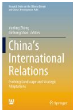
China's International Relations Ladenpreis: 164,99EUR

Wir haben andere Produkte gefunden, die Ihnen gefallen könnten!