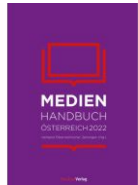
Medienhandbuch Österreich 2022 Ladenpreis: 34,90EUR