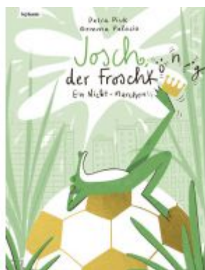
Josch der Froschkönig – Ein Nicht-Märchen Ladenpreis: 18,50EUR