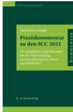
Praxiskommentar zu den SCC 2021 Ladenpreis: 128,00EUR