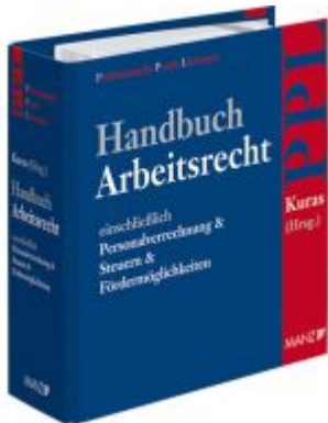
Handbuch Arbeitsrecht Ladenpreis: 198,00EUR