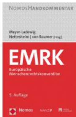
EMRK - Europäische Menschenrechtskonvention Ladenpreis: 142,90EUR