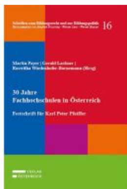
30 Jahre Fachhochschulen in Österreich Ladenpreis: 95,00EUR