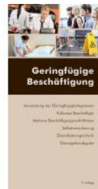
Geringfügige Beschäftigung Ladenpreis: 13,20EUR