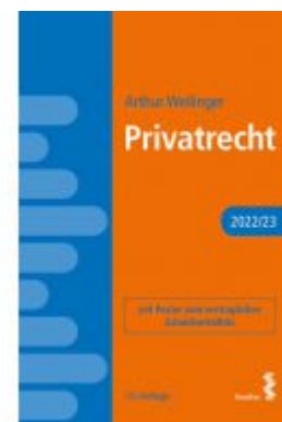
Privatrecht Ladenpreis: 48,00EUR