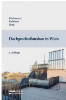
Dachgeschoßausbau in Wien Ladenpreis: 79,00EUR