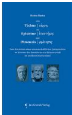
Von Téchne zu Epistème und Phrónesis Ladenpreis: 39,90EUR

Wir haben andere Produkte gefunden, die Ihnen gefallen könnten!