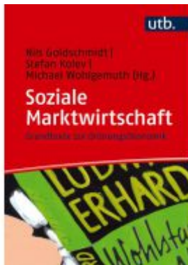
Soziale Marktwirtschaft Ladenpreis: 36,00EUR