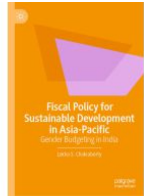
Fiscal Policy for Sustainable Development in Asia-Pacific Ladenpreis: 131,99EUR