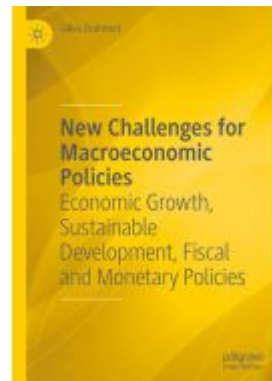
New Challenges for Macroeconomic Policies Ladenpreis: 142,99EUR