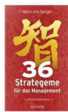
36 Strategeme für das Management Ladenpreis: 36,00EUR