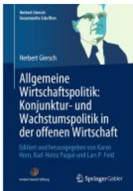
Allgemeine Wirtschaftspolitik: Konjunktur- und Wachstumspolitik in der offenen Wirtschaft Ladenpreis: 61,67EUR