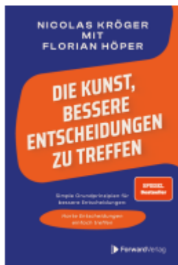
Die Kunst, bessere Entscheidungen zu treffen Ladenpreis: 15,00EUR