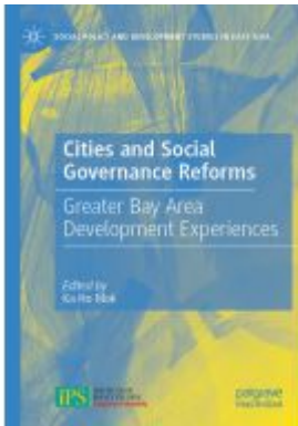
Cities and Social Governance Reforms Ladenpreis: 186,99EUR