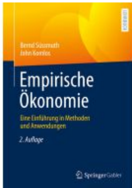
Empirische Ökonomie Ladenpreis: 35,97EUR