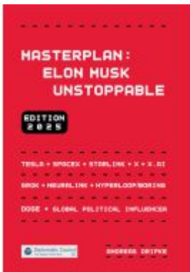
Masterplan: Elon Musk Unstoppable Ladenpreis: 35,90EUR

Wir haben andere Produkte gefunden, die Ihnen gefallen könnten!