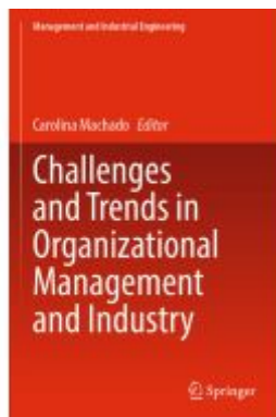
Challenges and Trends in Organizational Management and Industry Ladenpreis: 175,99EUR