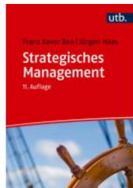
Strategisches Management Ladenpreis: 60,70EUR