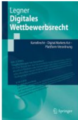
Digitales Wettbewerbsrecht Ladenpreis: 30,83EUR