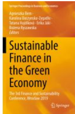
Sustainable Finance in the Green Economy Ladenpreis: 219,99EUR