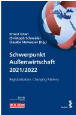
Schwerpunkt Außenwirtschaft 2021/2022 Ladenpreis: 19,80EUR