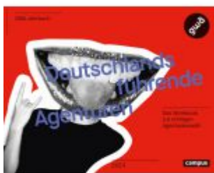
Deutschlands führende Agenturen Ladenpreis: 49,40EUR