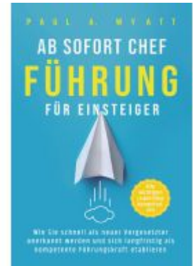
Ab sofort Chef – Führung für Einsteiger: Wie Sie schnell als neuer Vorgesetzter anerkannt werden und sich langfristig als kompetente Führungskraft etablieren | Alle wichtigen Leadership Kompetenzen Ladenpreis: 20,60EUR