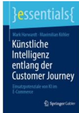
Künstliche Intelligenz entlang der Customer Journey Ladenpreis: 15,41EUR