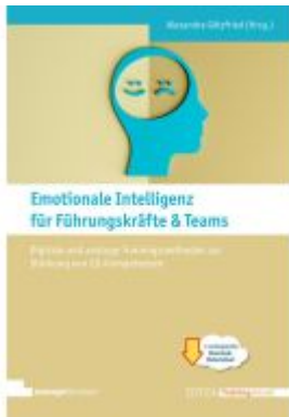
Emotionale Intelligenz für Führungskräfte & Teams Ladenpreis: 51,30EUR