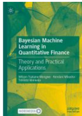
Bayesian Machine Learning in Quantitative Finance Ladenpreis: 153,99EUR