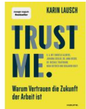
Trust me. Warum Vertrauen die Zukunft der Arbeit ist Ladenpreis: 30,90EUR