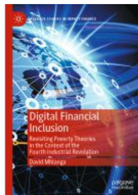
Digital Financial Inclusion Ladenpreis: 131,99EUR