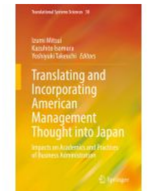
Translating and Incorporating American Management Thought into Japan Ladenpreis: 109,99EUR