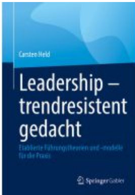
Leadership – trendresistent gedacht Ladenpreis: 41,11EUR