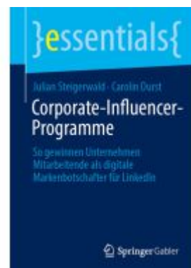
Corporate-Influencer-Programme Ladenpreis: 15,41EUR