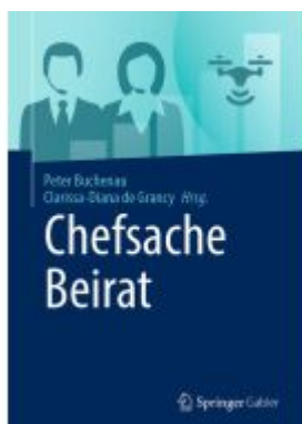
Chefsache Beirat Ladenpreis: 41,11EUR