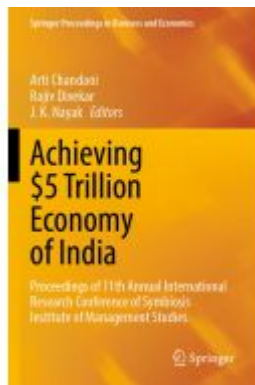
Achieving $5 Trillion Economy of India Ladenpreis: 175,99EUR