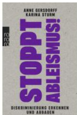
Stoppt Ableismus! Ladenpreis: 15,50EUR

Wir haben andere Produkte gefunden, die Ihnen gefallen könnten!