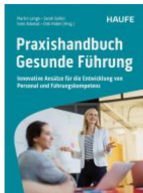
Praxishandbuch Gesunde Führung Ladenpreis: 61,70EUR