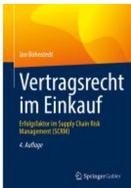
Vertragsrecht im Einkauf Ladenpreis: 51,39EUR