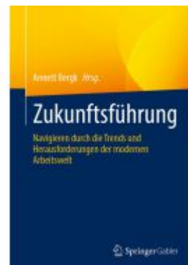
Zukunftsführung Ladenpreis: 51,39EUR