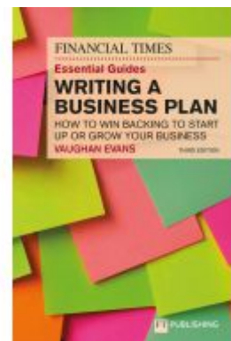
The Financial Times Essential Guide to Writing a Business Plan: How to win backing to start up or grow your business Ladenpreis: 26,74EUR