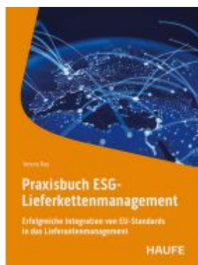
Praxisbuch ESG-Lieferkettenmanagement Ladenpreis: 72,00EUR