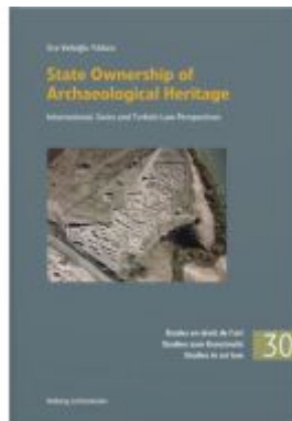
State Ownership of Archaeological Heritage: International, Swiss and Turkish Law Perspectives Ladenpreis: 64,00EUR