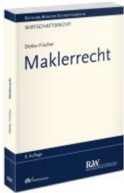
Maklerrecht Ladenpreis: 132,70EUR