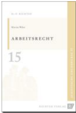
Juristische Grundkurse / Band 15 - Arbeitsrecht Ladenpreis: 11,10EUR