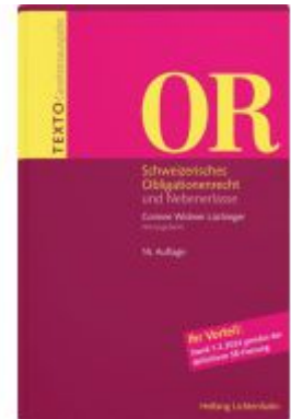
TEXTOR OR Ladenpreis: 28,00EUR