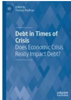
Debt in Times of Crisis Ladenpreis: 175,99EUR