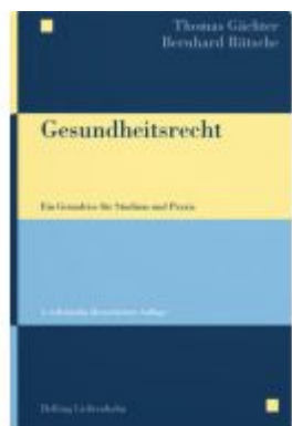
Gesundheitsrecht Ladenpreis: 75,00EUR