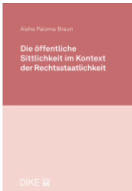
Die öffentliche Sittlichkeit im Kontext der Rechtsstaatlichkeit Ladenpreis: 108,00EUR