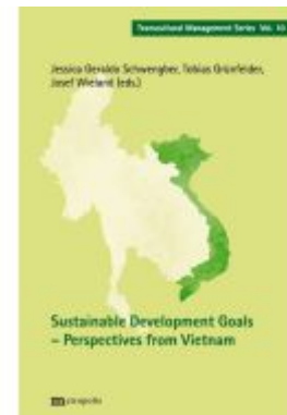
Sustainable Development Goals - Perspectives from Vietnam Ladenpreis: 39,10EUR