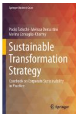
Sustainable Transformation Strategy Ladenpreis: 65,99EUR