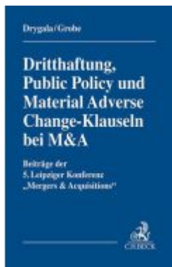
Dritthaftung, Public Policy und Material Adverse Change-Klauseln bei M&A Ladenpreis: 77,10EUR