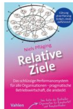
Relative Ziele Ladenpreis: 17,40EUR