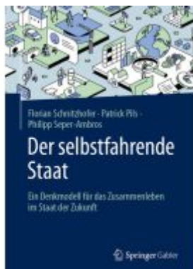
Der selbstfahrende Staat Ladenpreis: 61,67EUR