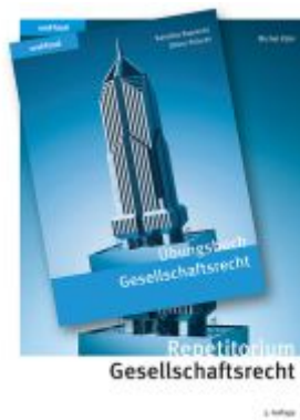
Gesellschaftsrecht Kombipaket Ladenpreis: 82,30EUR