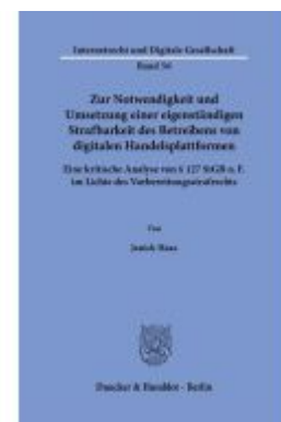
Zur Notwendigkeit und Umsetzung einer eigenständigen Strafbarkeit des Betreibens von digitalen Handelsplattformen. Ladenpreis: 102,70EUR