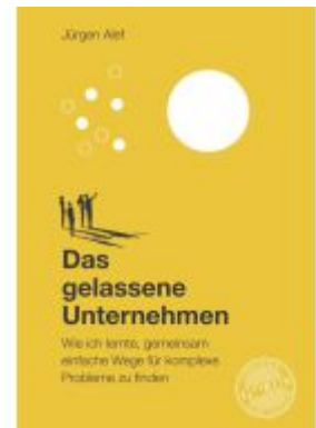
Das gelassene Unternehmen Ladenpreis: 18,50EUR