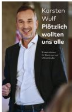
Plötzlich wollten uns alle Ladenpreis: 15,40EUR