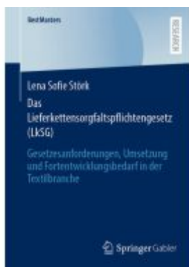
Das Lieferkettensorgfaltspflichtengesetz (LkSG) Ladenpreis: 61,67EUR