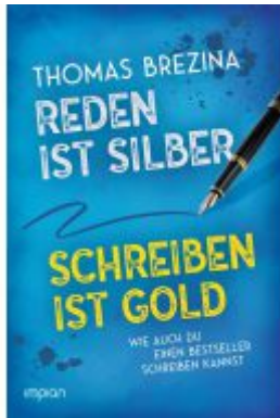
Reden ist Silber, Schreiben ist Gold Ladenpreis: 9,95EUR