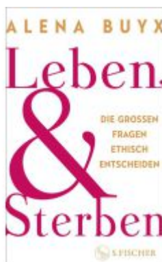
Leben und Sterben Ladenpreis: 24,70EUR