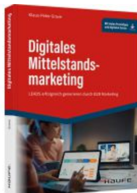
Digitales Mittelstandsmarketing Ladenpreis: 41,10EUR