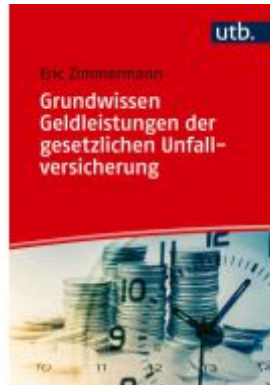
Grundwissen Geldleistungen der gesetzlichen Unfallversicherung Ladenpreis: 28,70EUR