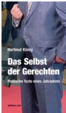
Das Selbst der Gerechten Ladenpreis: 18,50EUR