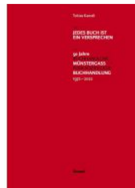
Jedes Buch ist ein Versprechen Ladenpreis: 18,50EUR