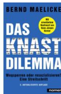
DAS KNAST-DILEMMA Ladenpreis: 25,60EUR