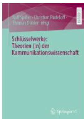
Schlüsselwerke: Theorien (in) der Kommunikationswissenschaft Ladenpreis: 39,05EUR