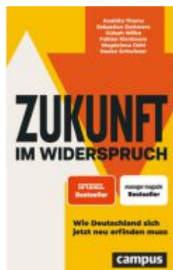
Zukunft im Widerspruch Ladenpreis: 32,90EUR