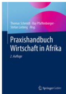
Praxishandbuch Wirtschaft in Afrika Ladenpreis: 61,67EUR