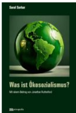
Was ist Öko-Sozialismus? Ladenpreis: 18,50EUR