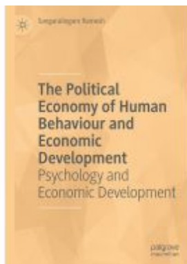
The Political Economy of Human Behaviour and Economic Development Ladenpreis: 109,99EUR