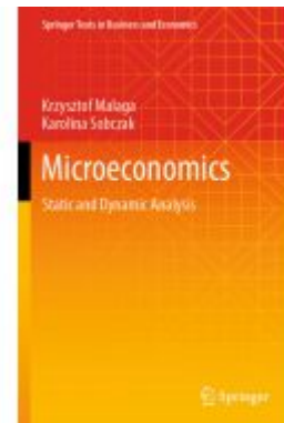
Microeconomics Ladenpreis: 71,49EUR