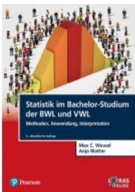
Statistik im Bachelor-Studium der BWL und VWL Ladenpreis: 34,95EUR