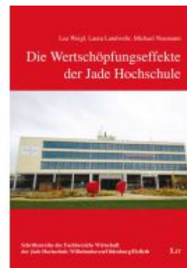
Die Wertschöpfungseffekte der Jade Hochschule Ladenpreis: 34,90EUR