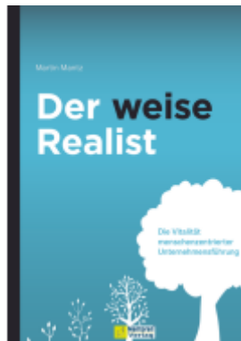
Der weise Realist Ladenpreis: 25,70EUR