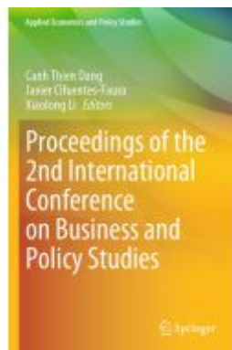
Proceedings of the 2nd International Conference on Business and Policy Studies Ladenpreis: 274,99EUR