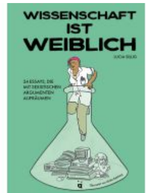
Wissenschaft ist weiblich Ladenpreis: 25,70EUR