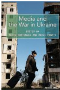
Media and the War in Ukraine Ladenpreis: 105,40EUR