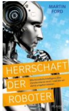
Herrschaft der Roboter Ladenpreis: 25,60EUR