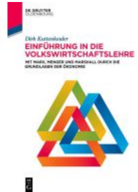
Einführung in die Volkswirtschaftslehre Ladenpreis: 44,95EUR