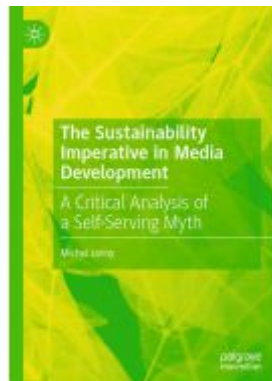
The Sustainability Imperative in Media Development Ladenpreis: 142,99EUR