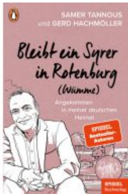
Bleibt ein Syrer in Rotenburg (Wümme) Ladenpreis: 13,40EUR